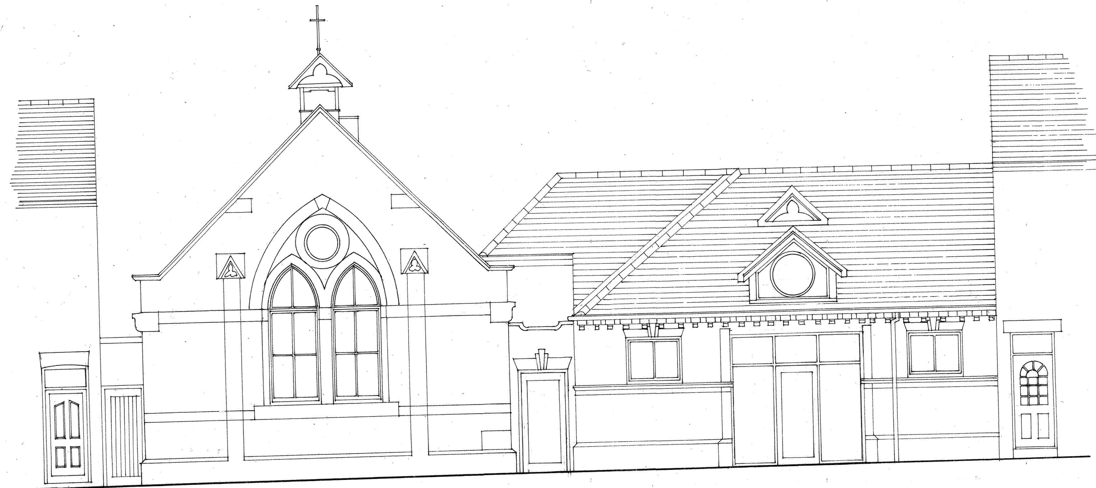
Front Elevation (North)